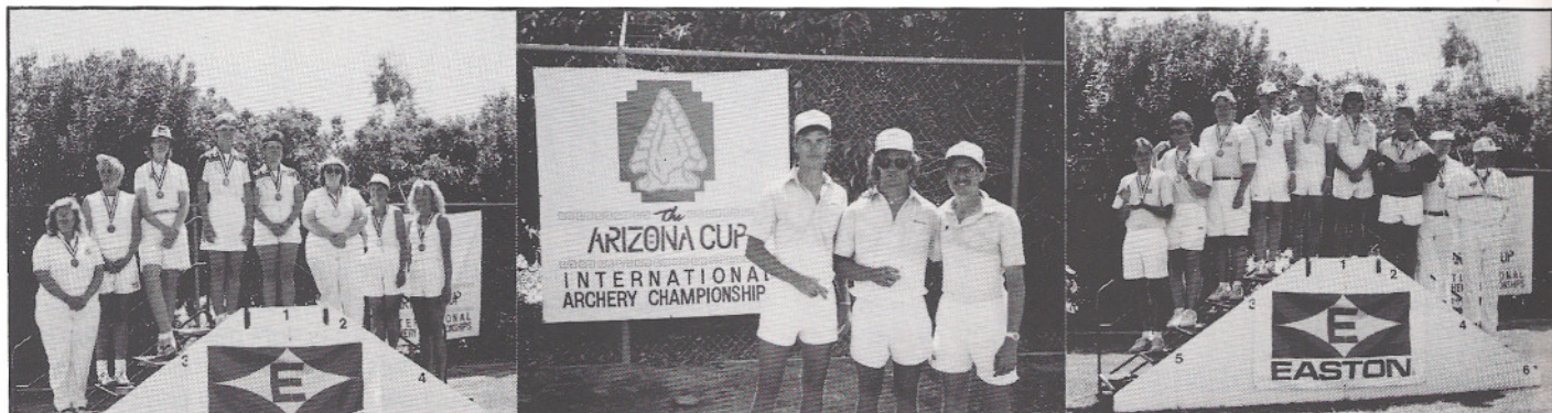
1ST PLACE TEAM - USAT#1 (C), 2ND - USAT#2 (R), 3RD - ASAA (L)

APRIL 8-12, 1989 HOSTED BY THE ARIZONA STATE ARCHERY ASSOCIATION By DIANA CARR