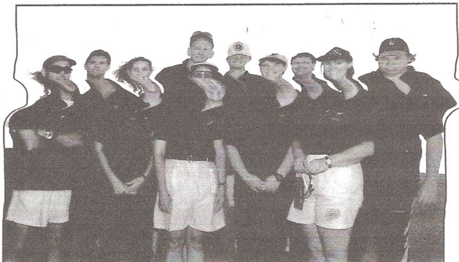
Australia sent 10 shooters and earned three medals!! Congratulations! Hope to see you next year!