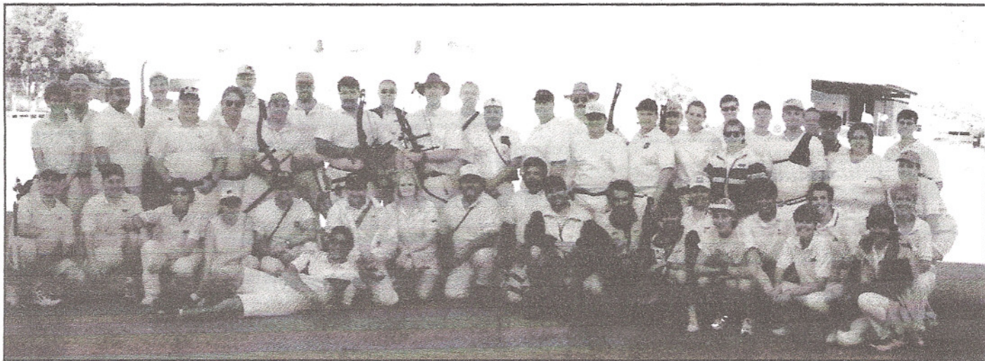
Arizona Cup Competitors