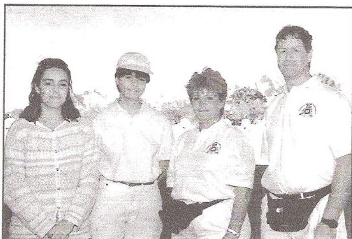
The team from Canada sent 4 shooters and took home a bronze medal