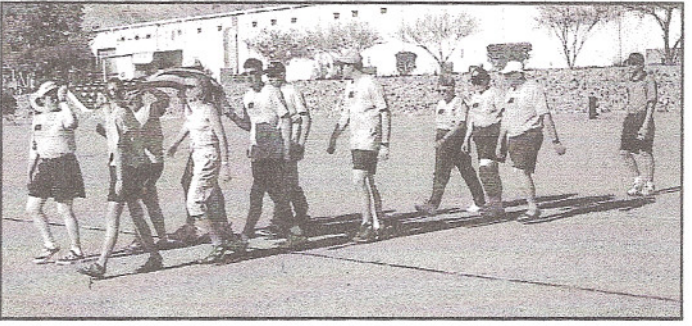
United States of America